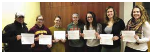
Twin Cities Cohort

Congratulations to the 2017 Recipients of the 1st Annual "Golden Sock Aid Award" for best custom-design of a low-tech adaptive device for a person with disabilities! The class of 2018 MOT student awardees are below. ■